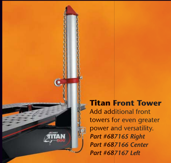
Titan Front Tower Add additional front towers for even greater power and versatility. Part #687165 Right Part #687166 Center Part #687167 Left