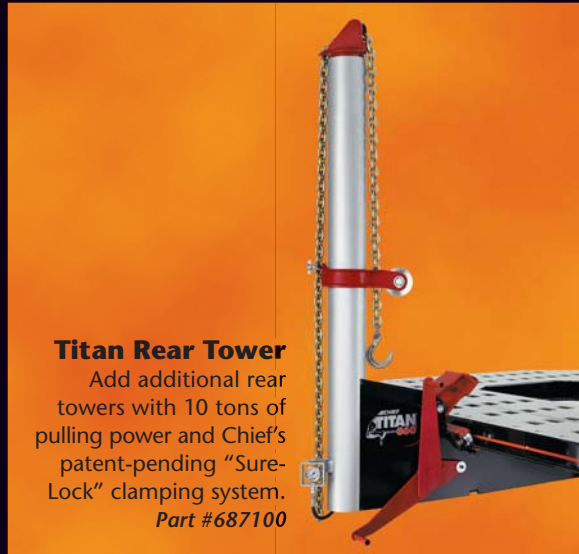
Titan Rear Tower Add additional rear towers with 10 tons of pulling power and Chief's patent-pending "Sure-Lock" clamping system. Part #687100