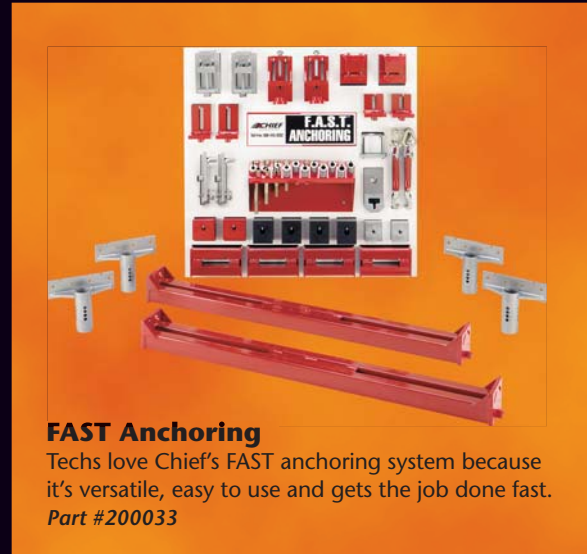
FAST Anchoring Techs love Chief's FAST anchoring system because it's versatile, easy to use and gets the job done fast. Part #200033

The Chief Titan-360. It's all the rack you'll ever need...and then some! Don't settle for less. Call today to find out more!